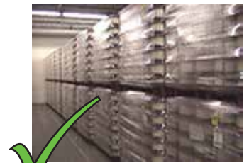
Are you still thinking?