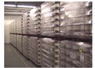
Are you still thinking?